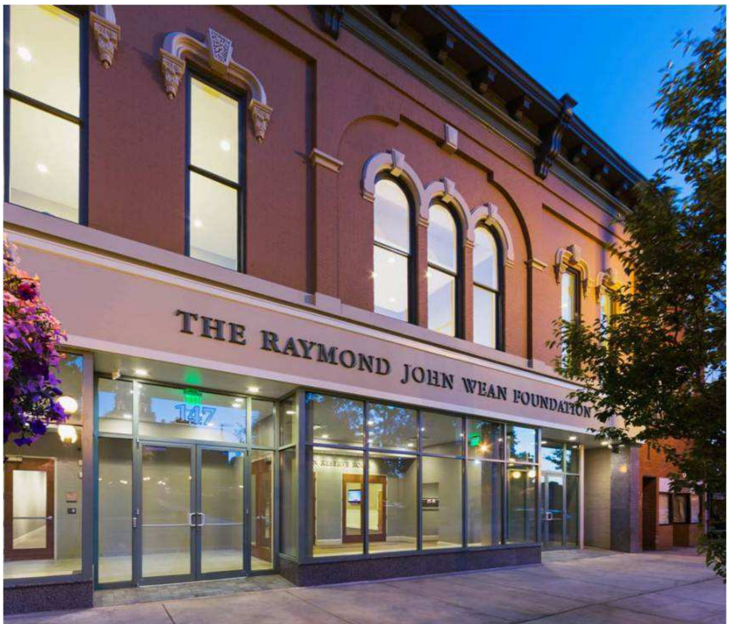
( https://mahoninghistory.files.wordpress.com/2015/05/picture1.jpg ) The Raymond John Wean Foundation – Market Block Building