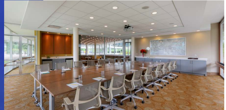
ASM World Headquarters • 1959