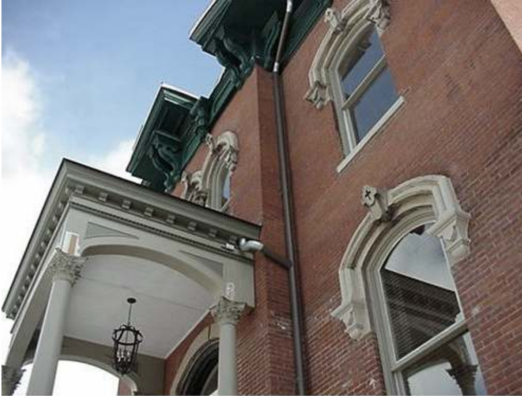
Kies-Murfey House • c. 1871