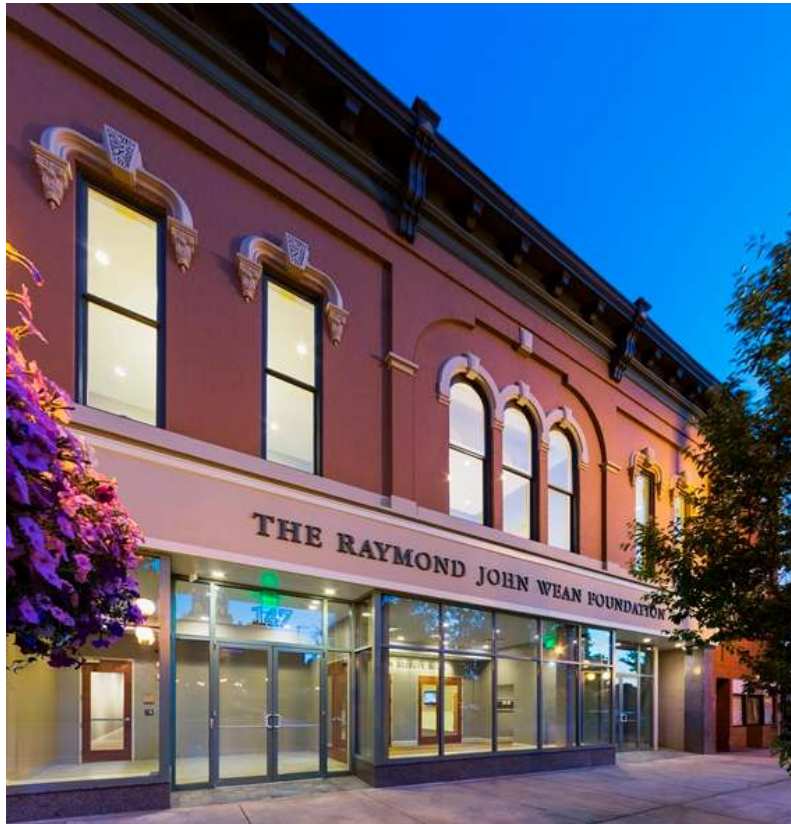
The Market Block Building • c.1868