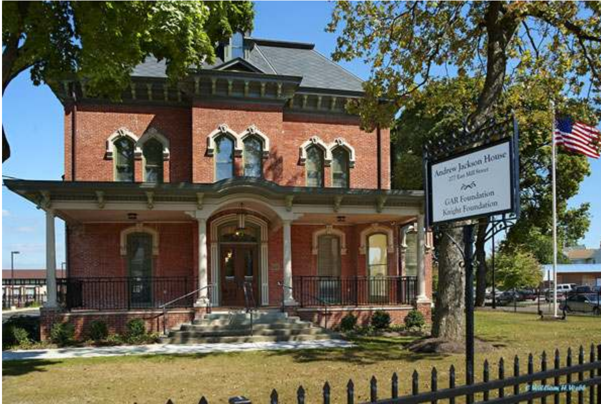
Andrew Jackson House • c.1868